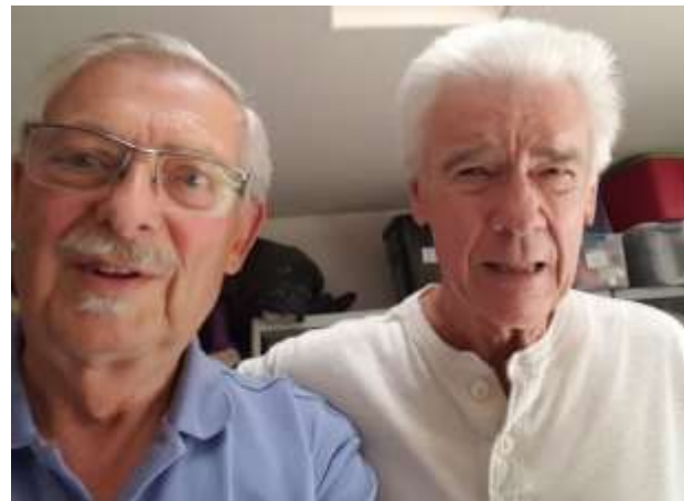
Ready for a haircut after more than two months!

Never in a million years could I have imagined I would go up to a bank teller wearing a mask and ask for money.